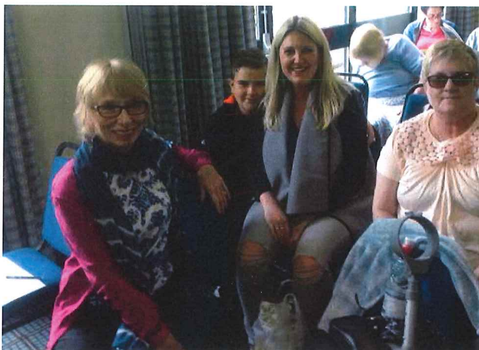
Visitors of all ages prepare for our Q&A session at our annual meeting in June 2016.

A NTF representative was appointed as someone to act as an advisor & campaigner for awareness of Essential Tremor in children, a cause that was brought about by the affect the condition had on their own son. The story of the child's difficulties in school & the parents' battle with the authorities were subsequently published on the NTF website.