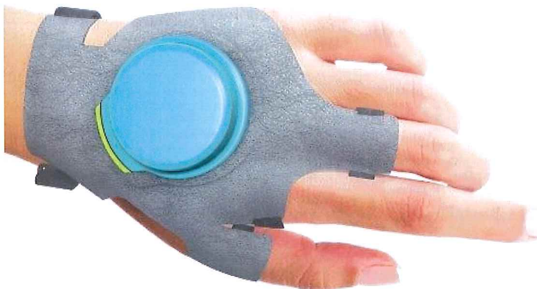
The Gyroglove is designed to increase hand stability. Mechanical gyroscopes within the glove are used to resist hand movements to allow for normal day-to-day activities.

The annual meeting in June attracted almost 100 people to the Holiday Inn in Brentwood where visitors included people from China keen to demonstrate their spoon which aids people with tremor. Gyrogear were also present to demonstrate their Gyroglove project. Presentations were given on MRI guided focused ultrasound treatment and the proposed changes to the NTF website. All trustees were available for a Q&A session which attracted many medical questions from the audience.