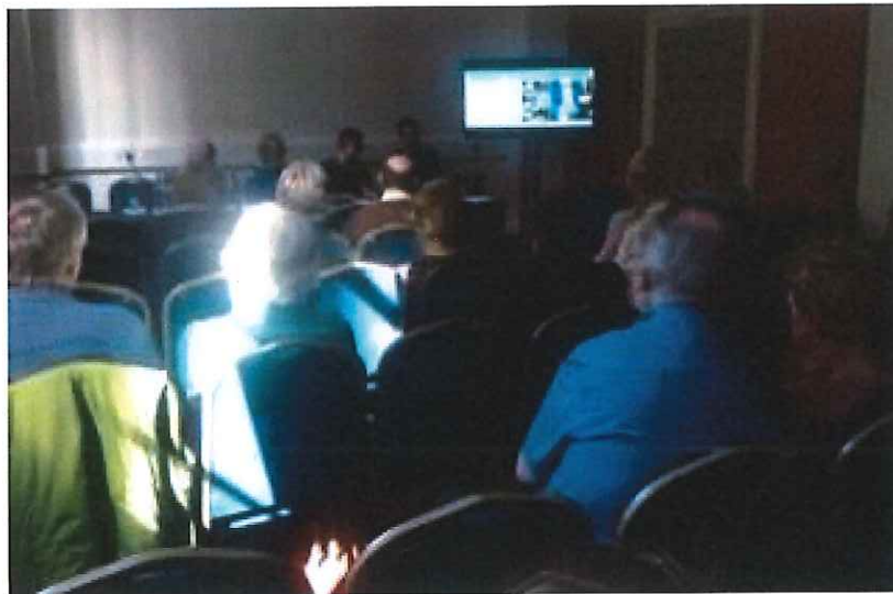
Visitors to our awareness day in March 2017 enjoying one of our presentations.